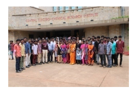
Our Students at CECRI, Karaikudi during the visit

65 students accompanied by 3 staff members visited Central Electro Chemical Research Institute, Karaikudi on 26<sup>th</sup> September, 2019. The Field Visit was organized under IIC by R&D Section. The main objective of the visit is to make the students get familiar in the construction of batteries and the chemical process involved in conversion of chemicals to current.