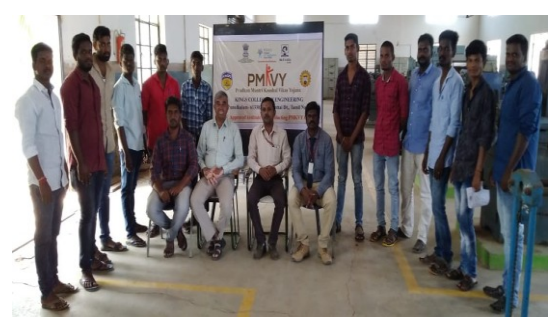
A view of the participants during the assessment along with examiner from Skill Council